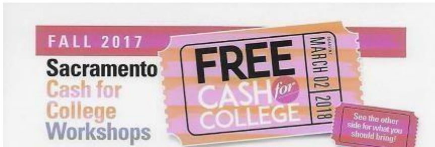
Cash for College:

Visit: http://www.saclibrary.org/Locations/Colonial-Heights